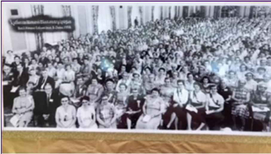
Photo from the 1958 Columbus Convention featuring zone members